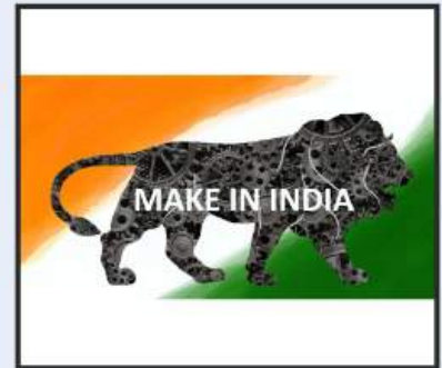
Make in India

Add.: Gat No.183/3, Waki Khurd, NH-60, Chakan, Pune, M.H.-410501